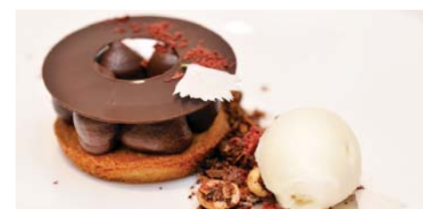
Popular Set Menu for groups of 10 or more