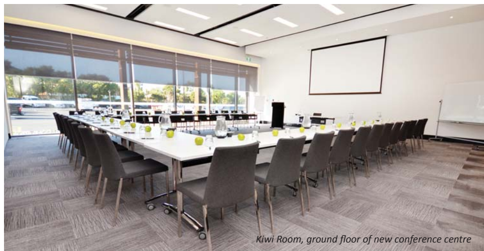
Kiwi Room, ground floor of new conference centre

One of the benefits of a conference centre is that we now have 2 kitchens on site, and a wonderful new range of F&B options! Our new complex includes a wonderful large restaurant space with a buffet line located at the heart of our conference centre where guests can enjoy conference lunches. Our new ballroom can cater to gala dinners, and the top floor of the conference centre with views over the city lights and to Rangitoto plus the option of a private bar will bring real sparkle to your evening for either a cocktail function or private dinner. If you're after a quick coffee or morning tea our café is the ideal spot and you can enjoy the view over the landscaped wetland area while you eat. Chef Adrian has crafted a wide range of menu options, which cater to both large groups, but also offer an excellent selection for a smaller special event. Our large, modern spaces are